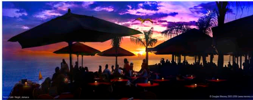
Rick's Café Sunset