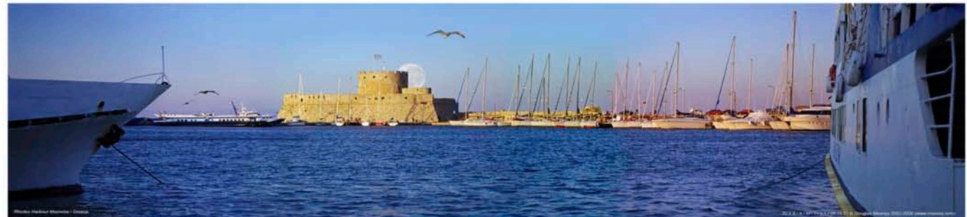
Rhodes Harbour Moonrise