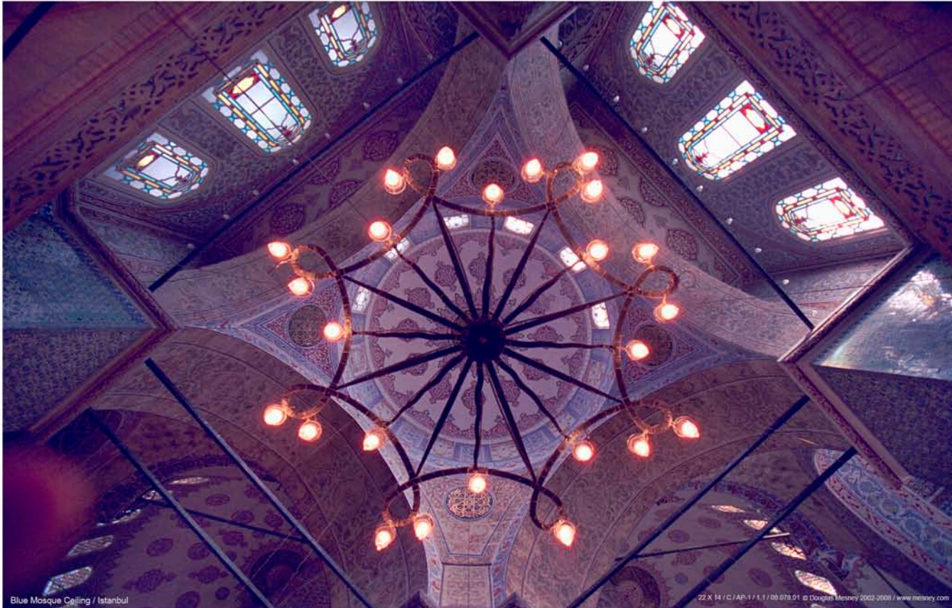
Blue Mosque Ceiling #1