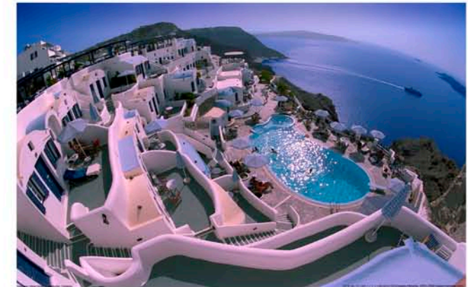
Volcano View Hotel Santorini