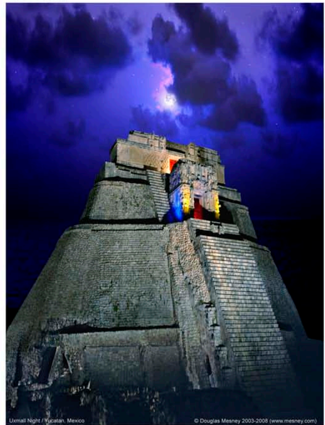
Uxmal Night / Yucatan, Mexico