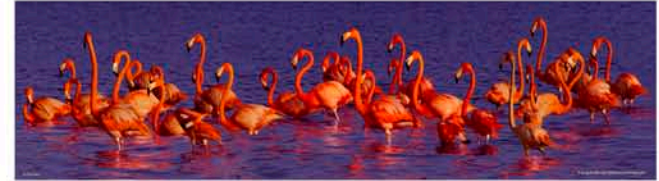
In The Pink