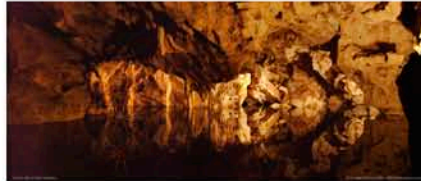
Cavern Mirror Pool