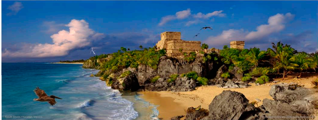
Tulum Storm / Yucatan, Mexico