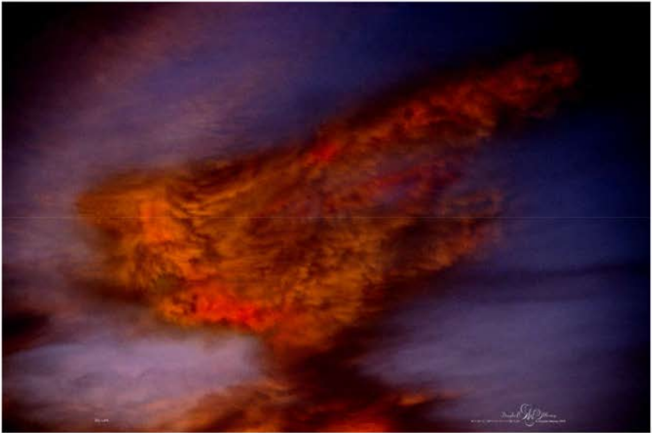
Sky Lark Skies Collection