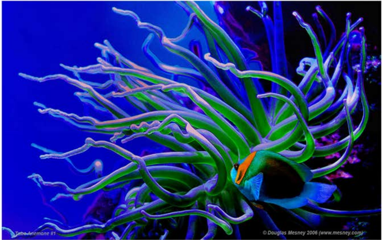
Tube Anemone Undercurrents Collection