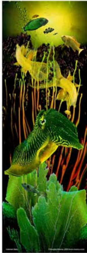
Calamari Baby Undercurrents Collection