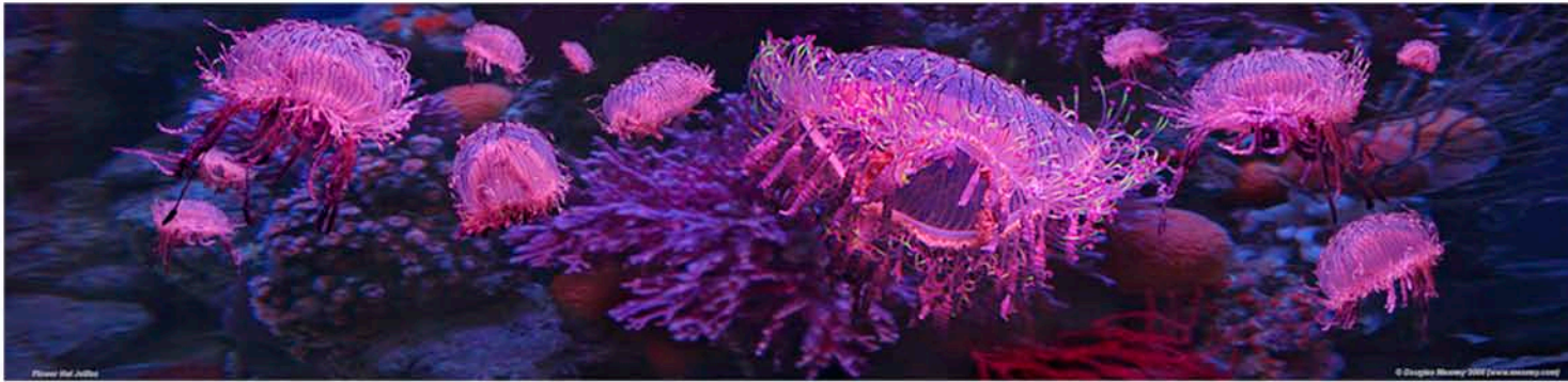
Flower Hat Jellyfish