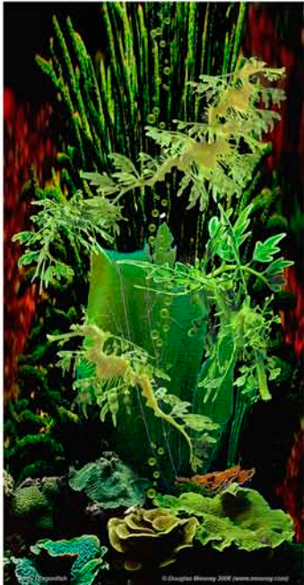
Leafy Dragon Fish