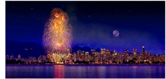
English Bay Fireworks